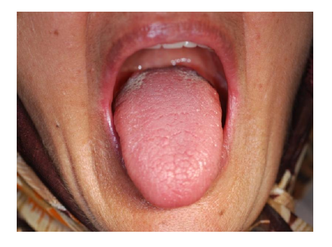
Fig. 1. Reddened and atrophic appearance of tongue due to chronic dry mouth condition