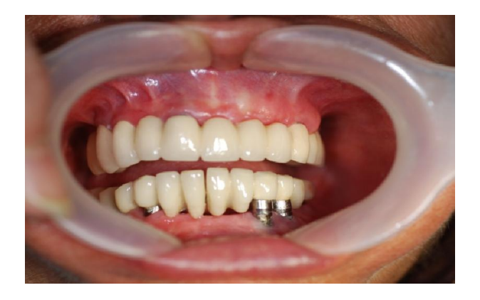
Fig. 2. Rehabilitation with maxillary and mandibular implantretained fixed prosthesis